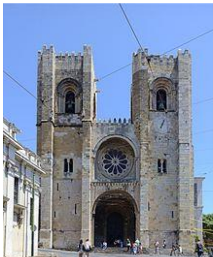
Façade of Lisbon Sé Cathedral

Hotel Roma has 24-hour, multilingual reception, a concierge and lift, and rooms are air-conditioned and have cable/satellite TV, hair dryers, etc. The hotel also offers, a dry cleaning and laundry service, currency exchange, safe-deposit box and souvenirs/gift shop.